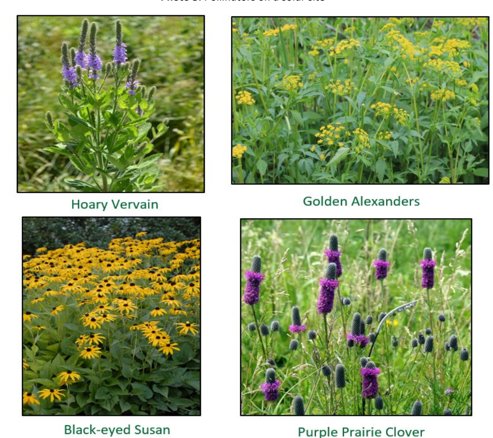
Photo 6. Proposed Pollinators for the Rutland West Solar Farm, LLC project site