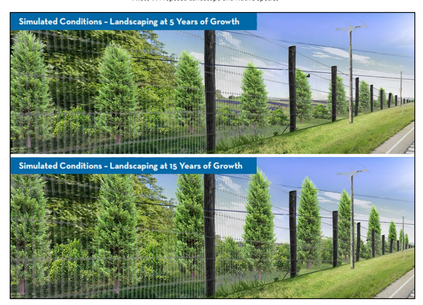
Photo 8. Rendered Image of Vegetation Buffer, Fixed Farm Knot Fence (8 ft tall) and Solar Panels (50 feet setback back property line. Simulated at 5-year growth and 15-year growth.